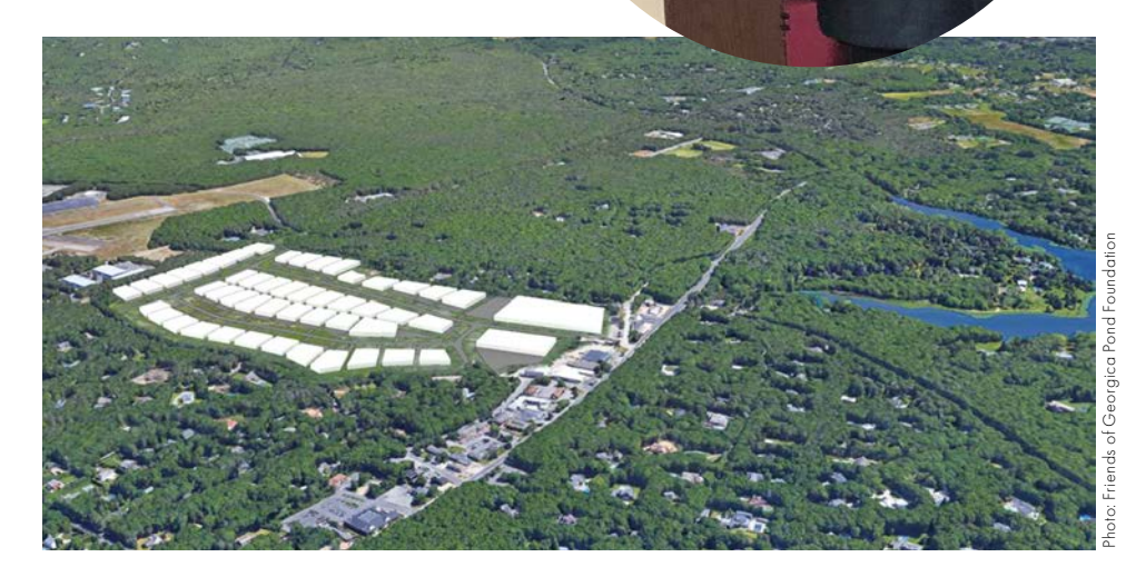
Rendering of the Wainscott Commercial Center proposed for Montauk Highway, just a few hundred feet from Georgica Pond.