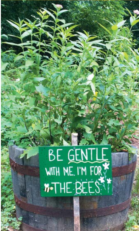
Native goldenrod and common milkweed are making a comeback in the new pollinator garden and are already attracting monarch butterflies and bees!