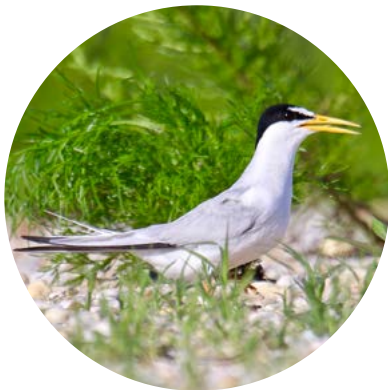
ABOVE: Least tern TOP RIGHT: Piping plover

THANK YOU Tommy! We are extremely grateful for your generous gift, which will help us protect threatened shorebirds that live and nest on our local beaches.