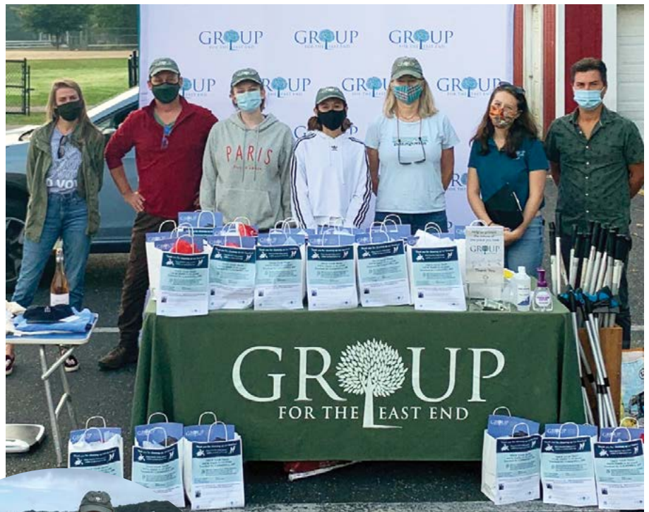
Participants were greeted at the drive-thru check-in at the Shelter Island School parking lot and received eco-gloves, trash bags and pickers. They returned with trunks full of trash.